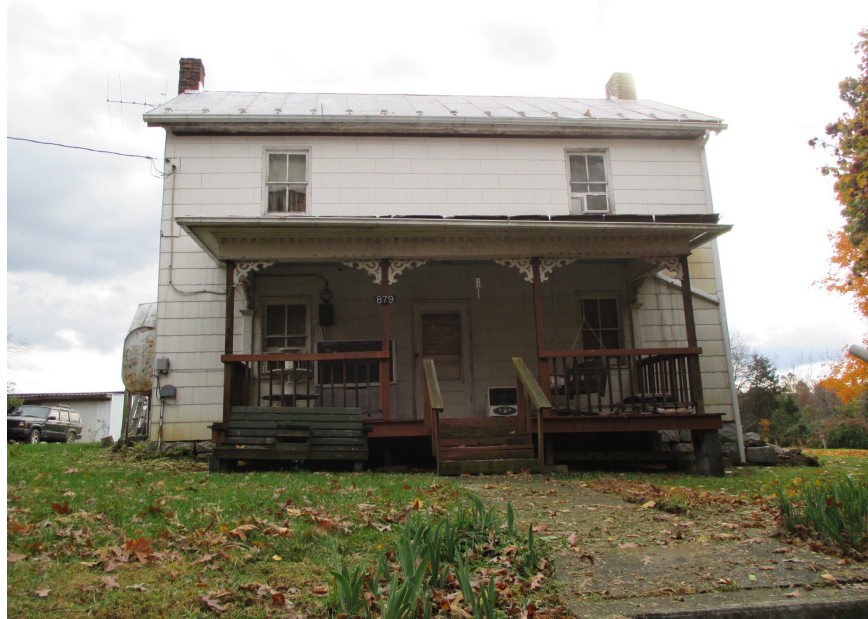
The Holler home on Headquarters Road in old Hamburg, now part of Edinburg, October 2015.